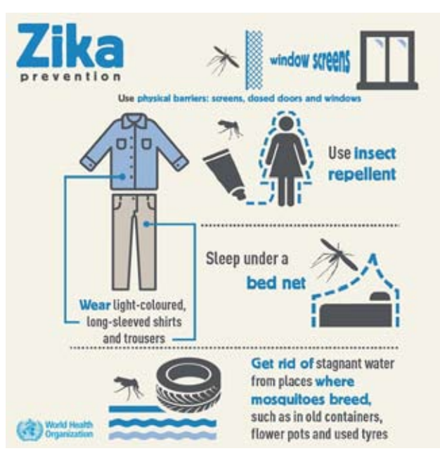
Zika prevention – recommended by World Health Organization

Currently, no treatment or vaccine for Zika virus is available. The World Health Organization (WHO) estimated that around 80% of people infected with Zika virus could recover by themselves. Zika virus disease is less serious than Dengue and there have been no recorded deaths related to Zika infection yet. However, this disease has a potential impact in relation to women who are pregnant or could become pregnant because it can affect the developing brain of the feotus in case the mother is infected.